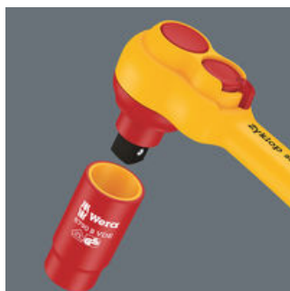
The ball lock ensures sockets and accessories fit securely, providing increased safety during operation. A short press on the release button allows the tool to be changed quickly.