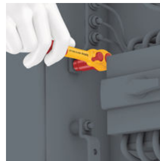
The extremely slim design of the Zyklop VDE ratchet makes it easy to work, even in confined spaces.